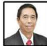
PDG. TEODORO LOCSON COUNCIL ON LEGISLATION DISTRICT REPRESENTATIVE