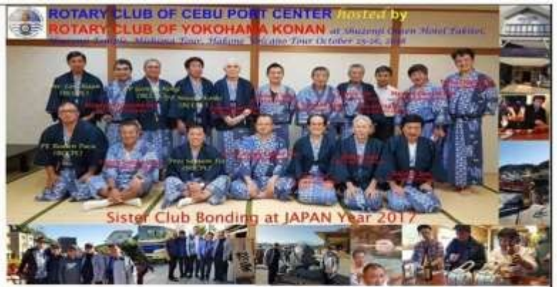
Sister Club Bonding at JAPAN Year 2017