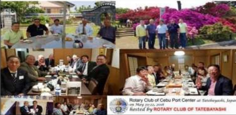
Rotary Club of Cebu Port Center at Tatebayashi, Japan on May 20-22, 2019 hosted by ROTARY CLUB OF TATEBAYASHI